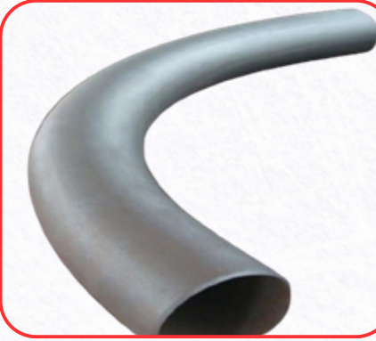
Hot Induction bend

STAINLESS STEEL: AISI 302, 304, 304L, 316, 316L, 310, 317, 317L, 321, 347, 410, 420, 904L etc CARBON STEEL: Bare Condition, Galvanized Phosphetised, Cadmium Plated, Hot Deep Gavanized, Bloodied, Nickel Chrome Plated etc. ALLOY STEEL: 4.6, 5.6, 6.6, 8.8, 10.9, & 12.9 / 'R', 'S', 'T' Conditions. NON FERROUS METAL: Copper, Brass, Aluminium, Titanium, Nichrome, Al. Bronze Phosphoros Bronze, etc TYPES: Equal Lateral Tee, Reducing Lateral Tee For More Details Visit: http://www.creativeforged.com/lateral-tee/