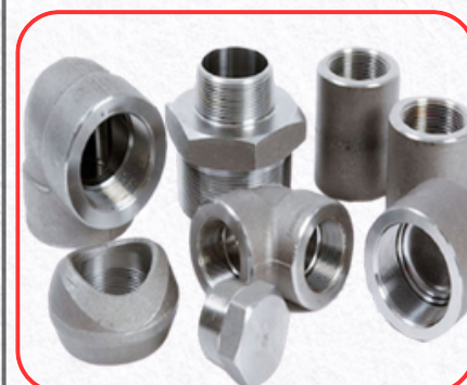
Forged Socket weld & Screwed Fitting

For More details Visit- http://www.creativeforged.com/flanges/