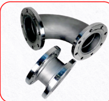
Pre-fabricated Pipe Fitting

SPECIFICATIONS: ASTM B 564 / ASTM SB 564 DIMENSIONS: ASTM 16.11, MSS SP-79, 83, 95, 97, BS 3799 SIZE: 1/8"-4" (DN6-DN100) MATERIAL: Stainless Steel, Carbon Steel, Alloys Steel, Monel, Nickel, Inconel, Hastalloy, Copper, Brass, Bronze, Titanium, Tantalum, Bismuth, Aluminium, High Speed Steel, Zinc, Lead etc. TYPES: Welding Olet, Sock Olet, Threaded Olet, Lateral Olet, Elbow Olet, Nipple Olet, SIZE: 1/4" NPS to 4" NPS. CLASS: 3000#, 6000#, 9000#. For More details Visit- http://www.creativeforged.com/forged-fittings/