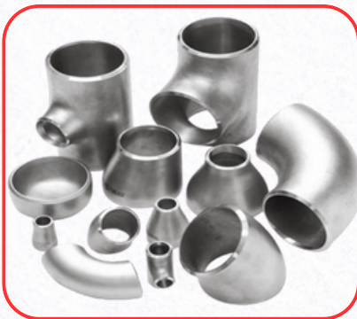
Butt Weld Fittings

STAINLESS STEEL: ASTM A403 WP 304 / 304L / 304H / 316 / 316L / 317 / 317L / 321 / 310 / 347 / 904L etc